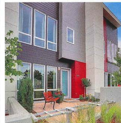
Aria Townhomes ARCHITECT: HUMPHRIES POLI ARCHITECTS OWNER/DEVELOPER: URBAN VENTURES LLC STRUCTURAL & CIVIL ENGINEER: MONROE & NEWELL ENGINEERS, INC. ELECTRICAL & MECHANICAL ENGINEER: BELFAY ENGINEERING GENERAL CONTRACTOR: HYDER CONSTRUCTION LANDSCAPE ARCHITECT: WENK ASSOCIATES, INC.