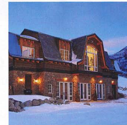
Snowmass Hillside Residence ARCHITECT: ROBERT G. SINCLAIR ARCHITECTURE, INC. GENERAL CONTRACTOR: CLEARWATER CONSTRUCTION MANAGEMENT STRUCTURAL ENGINEER: KURTZ & ASSOCIATES, INC. MECHANICAL ENGINEER: BURGGRAAF ASSOCIATES, INC. INTERIOR DESIGNER: RGS INTERIORS