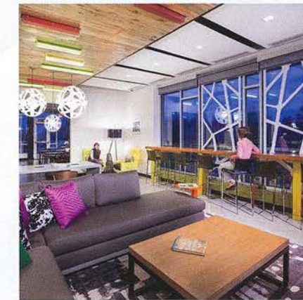
Lamar Station Crossing ARCHITECT: HUMPHRIES POLI ARCHITECTS OWNER/DEVELOPER: METRO WEST HOUSING SOLUTIONS GENERAL CONTRACTOR: CALCON CONSTRUCTORS STRUCTURAL ENGINEER: MONROE & NEWELL ENGINEERS, INC. ELECTRICAL & MECHANICAL ENGINEER: BELFAY ENGINEERING CIVIL ENGINEER: MARTIN/MARTIN INC. INTERIOR DESIGNER: STUDIO R ENERGY MODELER: GROUP14 ENGINEERING, INC. LANDSCAPE ARCHITECT: TCK DESIGN AND PLANNING